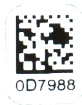
Figure 3: Matrix Code Sticker

All F&S hardware will ship with a matrix code sticker including the serial number. Enter your serial number here https://www.fs-net.de/en/support/serial-number-info-and-rma/ to get information on shipping date and type of board.