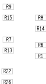
Figure 3: Config resistors position